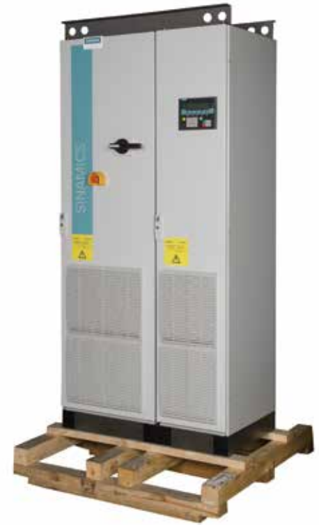
G150 type A on pallet, with transport beams (tophats removed)